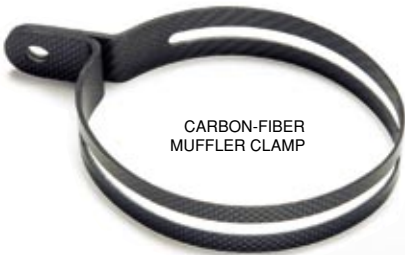
CARBON-FIBER MUFFLER CLAMP

The outer sleeve is available in carbon-fiber or titanium