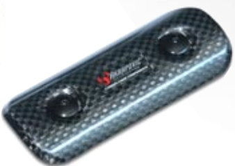
CARBON-FIBER HEAT SHIELD (OPTIONAL)