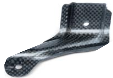
CARBON-FIBER CHASSIS HANGING BRACKET