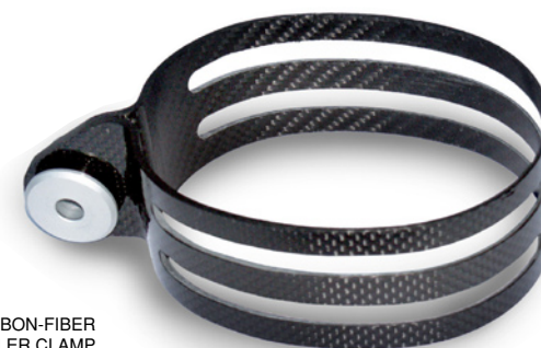
CARBON-FIBER MUFFLER CLAMP

Product code: 105587 (S-B12SO2-LTC) 105546 (S-B12SO2-LTT)