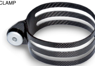
CARBON-FIBER MUFFLER CLAMP